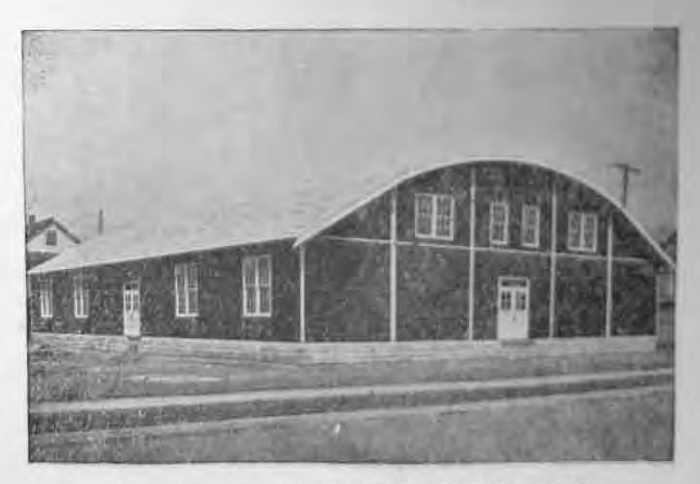
THE BRADLEY SCHOOL GYMNASIUM