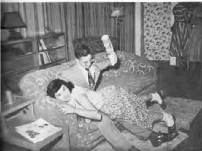
"MEN ARE LIKE STREETCARS"