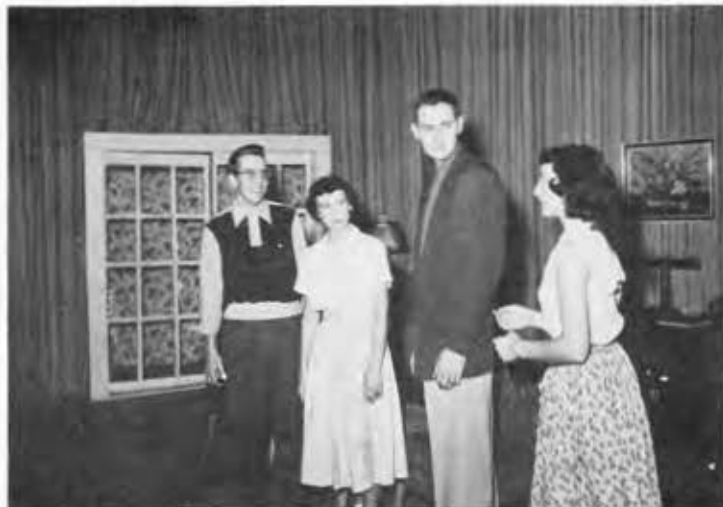
"MEN ARE LIKE STREETCARS"