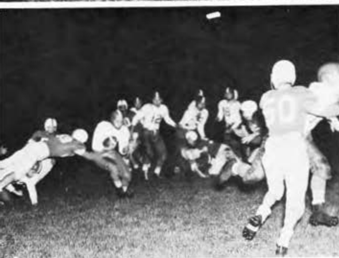
Tousie Clears The Way.