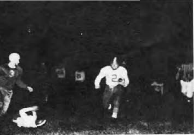
The Tiny Terror.